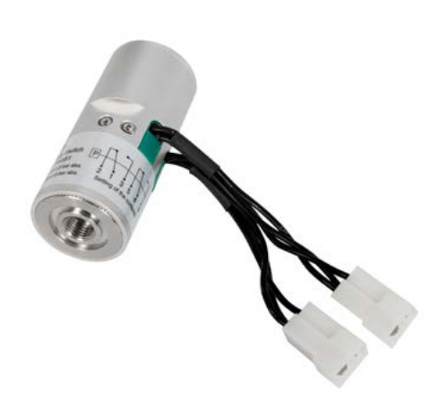
MDK40 Density Switch

They can provide multiple solutions to support new substations and the renovation and smart upgrading of existing substations.